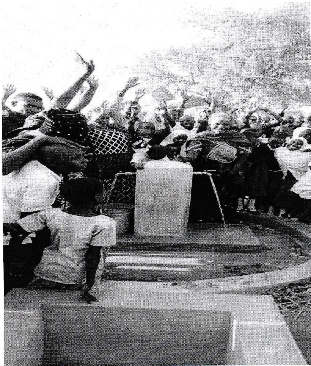
Community and Pupils at Ushora Primary school enjoying the availability of water as success of the project.