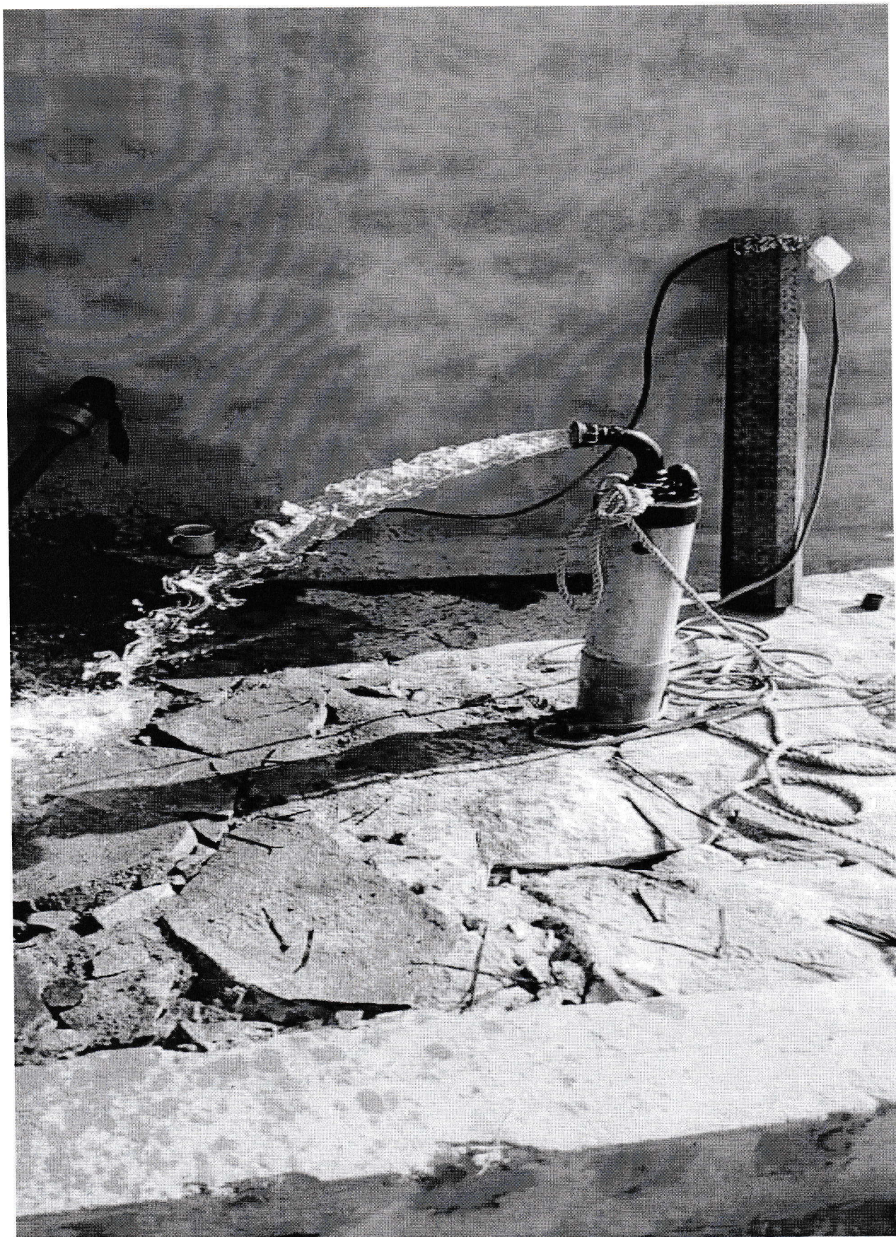
Photo1: Testing of submersible pump at Ushora borehole